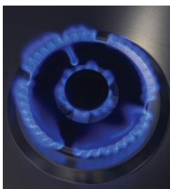
Pictured: ILVE Brass Burner

Functionally simple to use and a breeze to cook with, ILVE is truly the next generation in cooking.